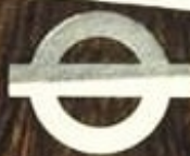
London Transport Recruitment poster, 1950s.