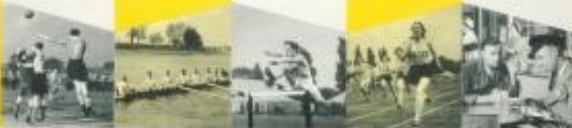
London Transport Recruitment poster, 1950s.

an appointment is made through the Ministry of Labour Employment Offices