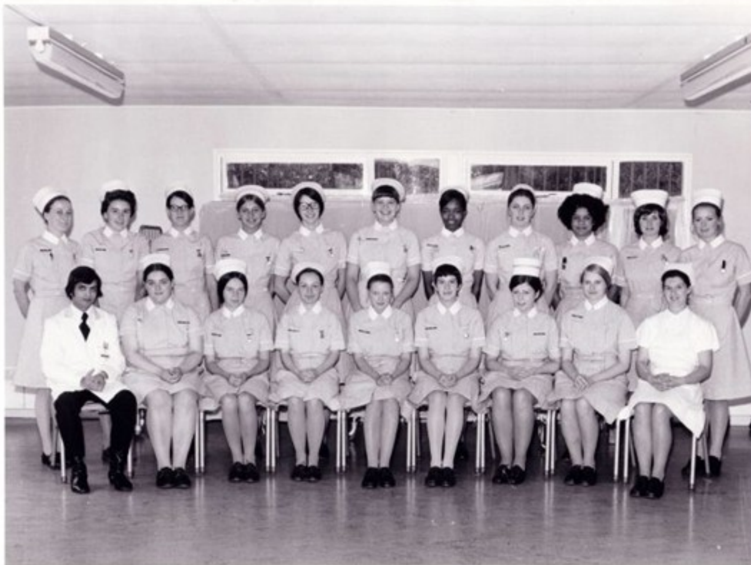
Nursing staff at St. Helier Hospital, Wrythe Lane, Sutton, 1971.